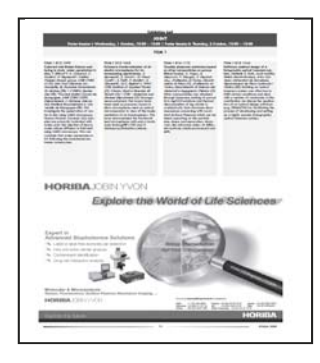
Example: 1/2 page ad b/w