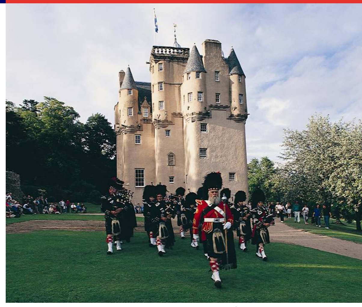
Aberdeen Exhibition and Conference Centre, Scotland (UK) | 25 - 28 September 2012