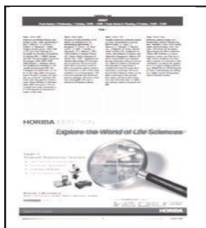
Example: 1/2 page ad b/w